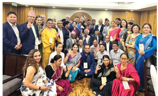
Nepalese delegation pose for Group Photo with Prof. Muhammad Yunus and Yunus Foundation Team after the closing session

He further shared his thoughts on why we need to reduce food wastage, reduce water uses and recycle and re-use of old household items. He also shared his thoughts on new topic of AI (Artificial Intelligence) which Prof. Yunus in his speech in the morning had talked about. He forenamed humans as the best creation of God but AI is developed by humans; therefore, AI cannot be treated as an option for humans' alternatives. But he opinioned that humans can use AI as a supporting tool only and not beyond.