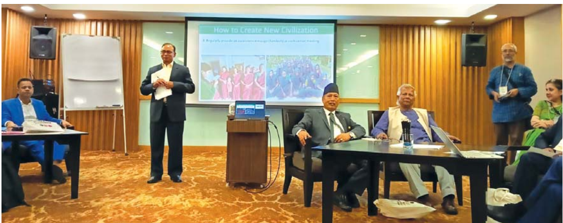
A scene from Nepal Country Forum Proceeding

The high officials and dignitaries from Microfinance Institutions (MFIs), Cooperatives, Government Investment Fund, Non-governmental Organizations working in the field of women empowerment and employment promotions along with senior officers from the Central Bank of Nepal – Nepal Rastra Bank (NRB) were the participants in the Nepal Forum.