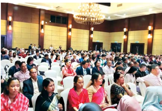
A view of participating delegation during the opening session of the Summit