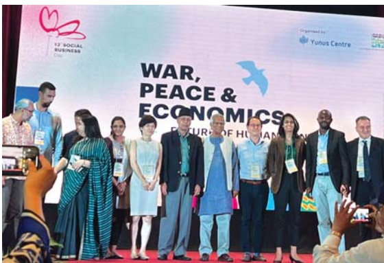
A group photo of all country forum rapporteurs with Prof. Yunus after report back session during the Summit