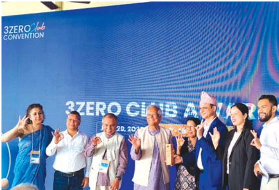
A Scene after JBLBS were awarded "Best 3zero supporting organization" during the 3Zero Convention