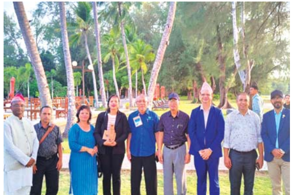
Participants of 3Zero Convention proudly pose for group photo with Award