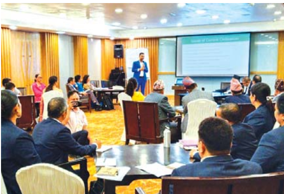
A scene of proceeding during the Nepal Forum