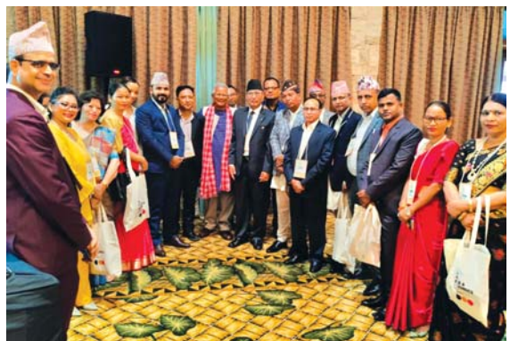
Nepali delegation team members takes group picture with Prof. Yunus during the Summit