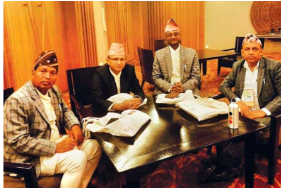
Participation from Sahara Nepal, Jhapa