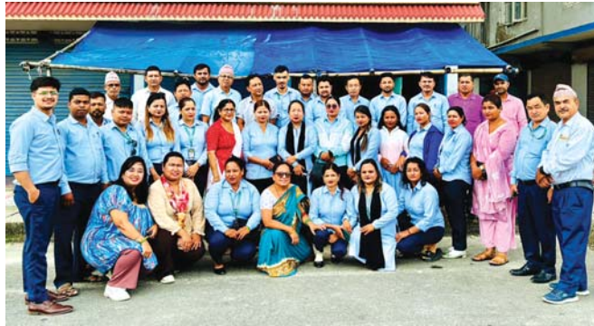
Participants of the Trainings from Navodaya

Creating sustainable enterprises positively impacting on the lives of the borrowers and society and economy, the Centre for Self-help Development (CSD) which has been campaigning for the entrepreneurship development among the microfinance members in the country. It organized three trainings of three-day long entrepreneurship development training programs at regional level. The events were organized from July 24 to 26, 2024 at Charpane, Jhapa for the employees of the Sahara Nepal SACCOS Ltd., from July 27 to 29, 2024, for the employees of Navodaya Multi-Purpose Cooperative Society Ltd. at Kerkha, Jhapa and from 17 to 19