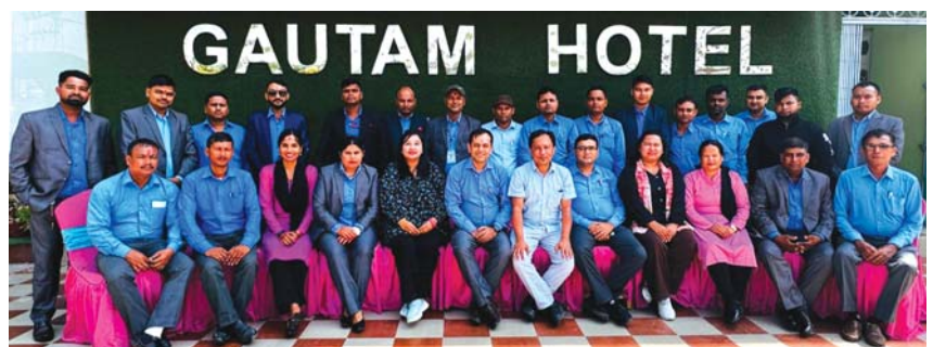
Participants of the Trainings from Sahara Nepal SACCOS (left) and Swabalamban LBSL (right)