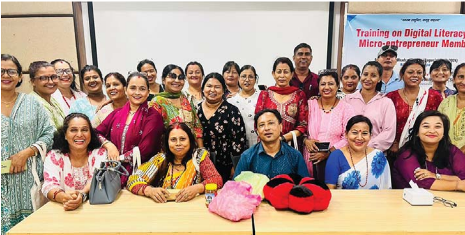
Participants of the Training

There has been increased e-commerce marketplace sales from the past few years in the country; with many new entrepreneurs and business been able to grow through direct retail sales in the internet. Also with access to rapidly progressing technological advances in smart phones and internet; together with consumers being more motivated than ever to stay home and shop on comfort with many emerging experience driven mobile apps, sites across many platforms; there is an increasing demand for online shopping in the country.