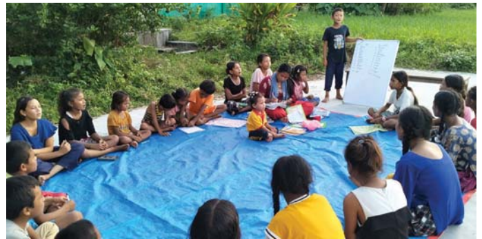
A Study Class in the Open Ground