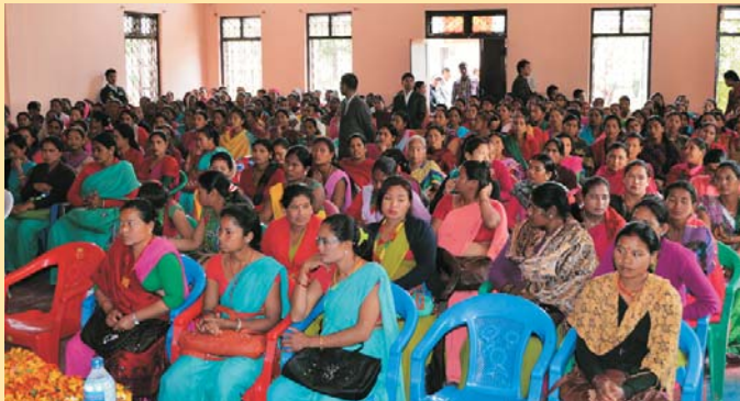
A view of Award Ceremony