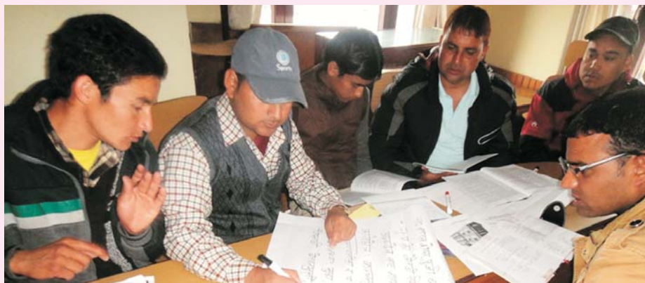
Participants preparing their presentation