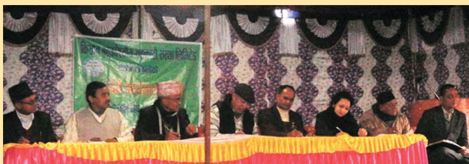
A view of Self-Evaluation Workshop

CSD provided technical support to the Kisan Multipurpose Cooperative Society, Lamki, Kailali to organize an intra institutional self-evaluation workshop on January 2, 2015. This workshop was participated by the Board Members, Loan and Accounts Committee Members, CEO, Senior Officers, Branch Managers and