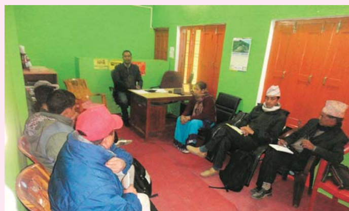
Participants during the study visit to Sreejanshil Saving and Credit Cooperative Ltd