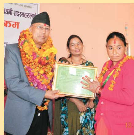
The chief guest handing and award to one of the winners

The Rural Women Development Centre (RWDC), a leading microfinance NGO in Dang in a fabulous 'Award Ceremony' held on 13th March, 2015 at the Municipality Hall, Ghorahi, Dang, awarded 24 women entrepreneurs as 'Successful Entrepreneur'. It also awarded 4 centers of Ghorahi branch, 4 of Lamahi branch, 4 of Tulsipur branch, 4 of Salyan branch, 4 of Narayanpur branch and 4 of Bhalubang branch as the "Best Centers" of microfinance members and the center leaders from Ghorahi, Narayanpur, Lamahi, Bhalubang, Tulsipur, Salyan, Bajipur and Gadhadhawa branches were awarded as the "Best Centre Chiefs" in the function attended by over 250 women members of microfinance groups, microfinance staff and dignitaries of Dang district. RWDC also honored two