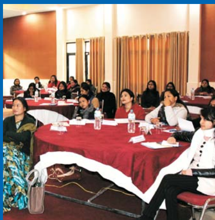
The participants during the session