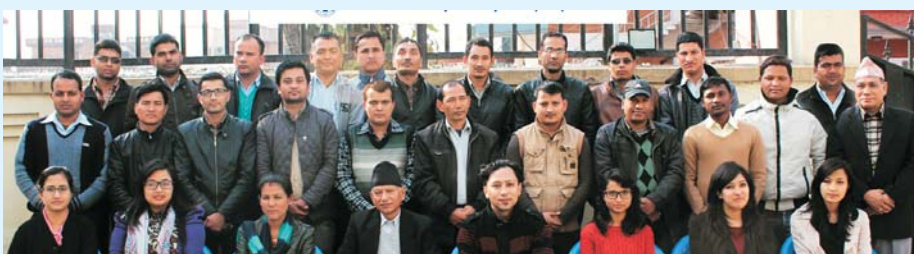
A group photograph of the participants

The Training on Credit Appraisal was organized by CSD from February 23-26, 2015. The participants of the program were employees of MFIs, FINGOs and Cooperatives. It was commenced to help the participants to systemize the process of credit appraisal to safeguard their loan