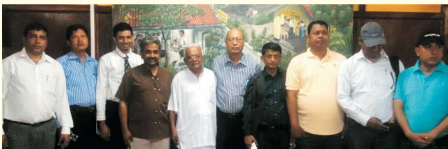
Nepali Delegates with Sarvodaya Champion Mr. A.T. Ariyaratne