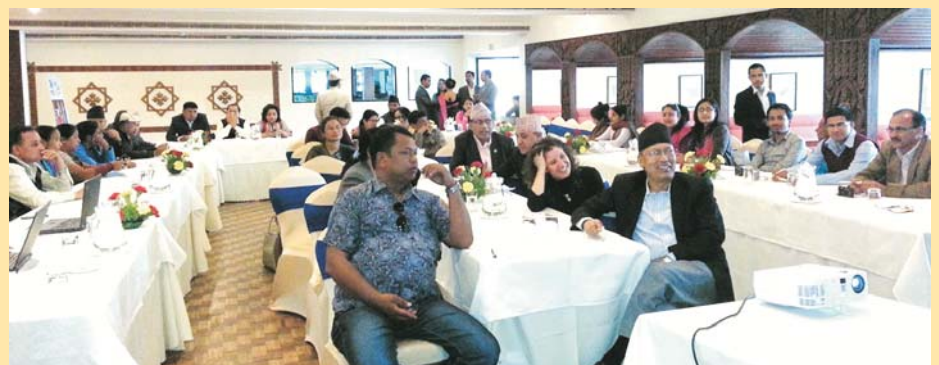
A view of the program