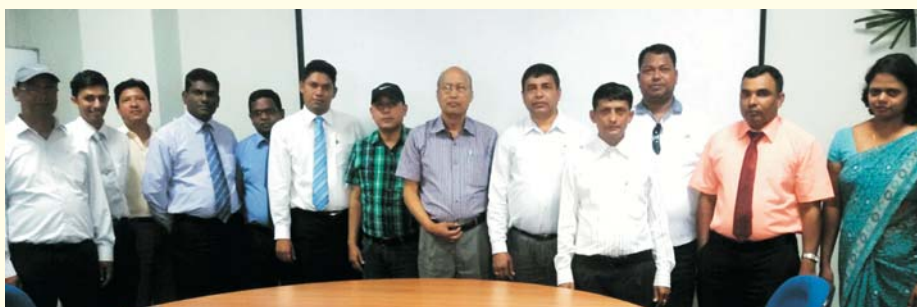
Nepali Delegates with the officials of SANASA Development Bank